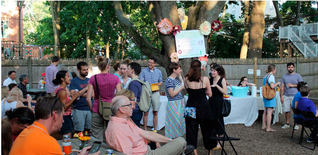
Friends and Neighbors filled the yard at Arts N' Craft Brews on August 1st, 2019