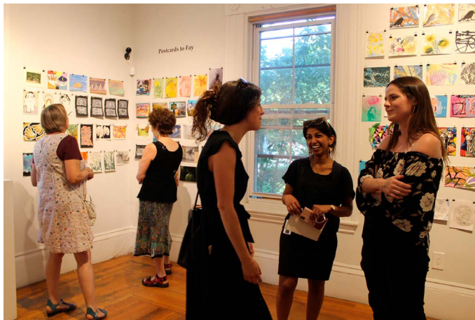
Arts N' Craft Brews attendees enjoying Postcards to Fay in the Fay Chandler Gallery

The Chandler Gallery can be one of a great many things, depending on who you ask. As one of the few existing galleries in Cambridge, and one of the even fewer galleries that allows artists to have solo shows, Chandler Gallery is a truly rare community space - by the community and for the community.